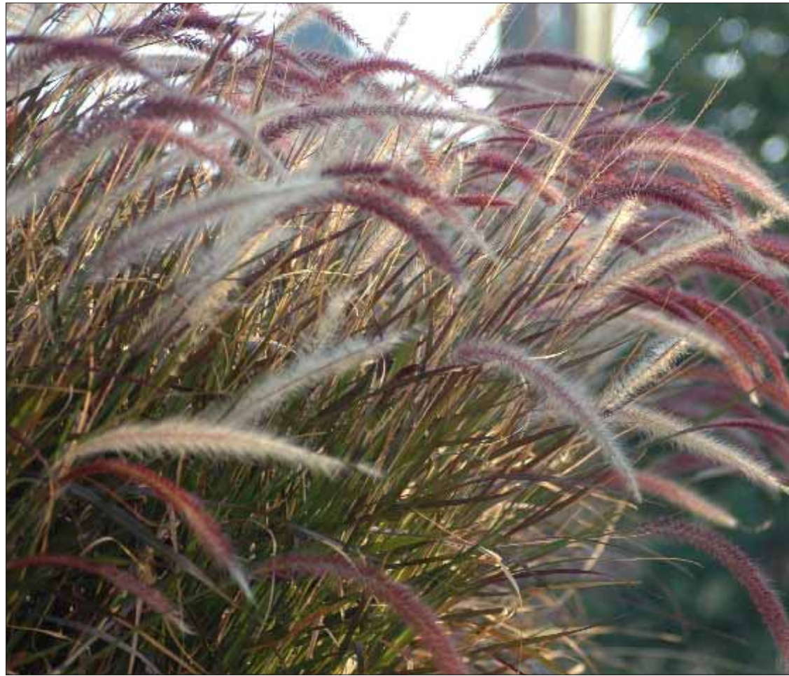
I found these at Dupont Circle. I just liked the colors and the shades of red, like in the flag. It's almost got multiple shades of red.