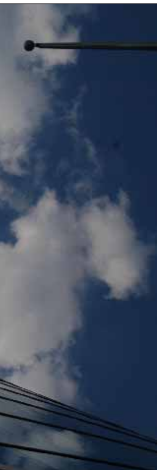
s of this building. I was waiting for a