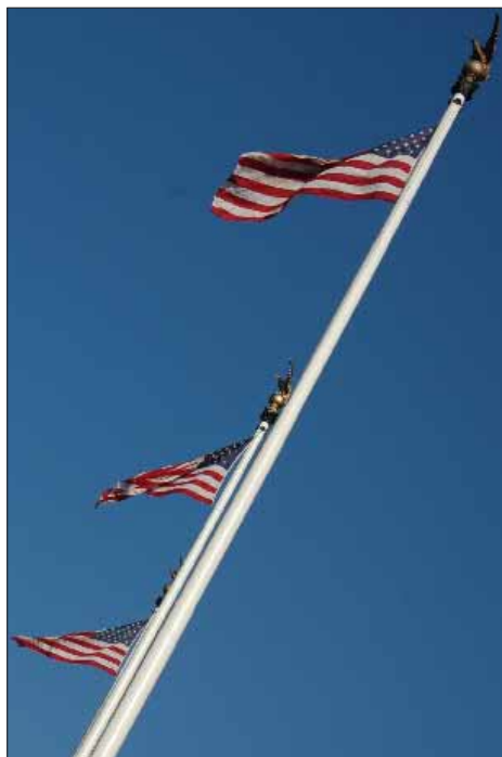
It looks like that the flag is leaning and falling down. After 9/11, hopefully that does not represent the country.