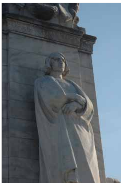
A statue of Columbus at Union Station. He looked like he was looking into the morning sun as it rose when he saw the New World.