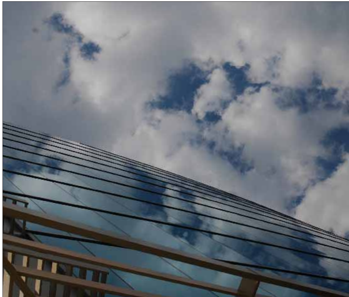
This is the National Association of Realtors building between Union Station and the shelter where I stay. I've taken lots of shots of the sky like that. This picture shows spacious skies, like the line from "America the Beautiful."

Street Sense vendor Cliff "The finds beauty in unusual places overlooked to the grand. The captures the nation's capital anniversary of the Sept. 11 a